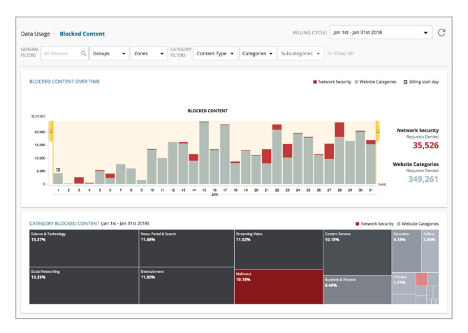
Sample blocked content dashboard: for illustration purposes only