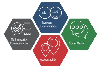
Core Components of Mass Emergency Notification System