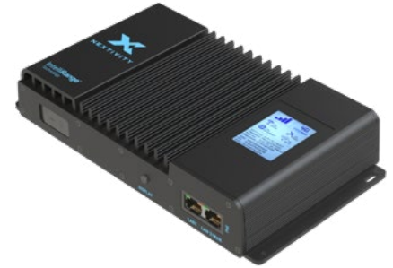
SHIELD MegaFi 2

SHIELD MegaFi 2 is an integrated high power 5G HPUE multi-port router and Wi-Fi hotspot device that operates on all AT&T bands. It is the first device that combines 5G support with HPUE performance – 6x the power of regular devices. With this power, MegaFi 2 provides FirstNet users and enterprises with reliable broadband connectivity, even in the most challenging environments. MegaFi 2 extends the range of user devices into remote areas and deep inside structures where standard signals won't reach. The device features a graphical display for monitoring performance and system status. This HPUE solution incorporates Nextivity IntelliRange® technology.