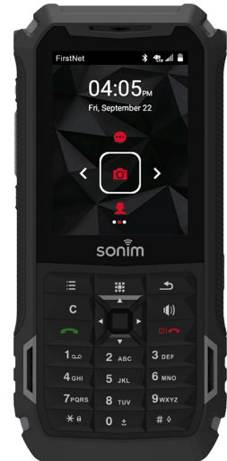
Sonim XP5s Handset 25 hours talk time

Discounted Sonim Devices on 2-year: Limited time offer. Available only to Public Safety Entities with a FirstNet Service Agreement (Business Agreement) and only for Agency Paid User lines of service. Subject to availability. New lines and eligible equipment upgrades. Requires purchase of new Sonim XP5s or XP8 (excludes AT&T Certified Restored) with a new 2-year service commitment and eligible postpaid voice and data service (Sonim XP8 minimum $39/month on FirstNet Mobile-Pooled or FirstNet Mobile-Unlimited plan; Sonim XP5s minimum $31/month on FirstNet Mobile-Pooled plan; other FirstNet plans may qualify). Discount applied at point of sale to undiscounted 2-year price of Sonim XP5s or XP8 via an instant discount. Tax on discounted price due at sale. Activation Fee: $45/line. Early Termination Fee/Cancellation Fee (att.com/equipmentETF): after 30 days, up to $325. Return/Restocking: Restocking fee up to $45 may apply.